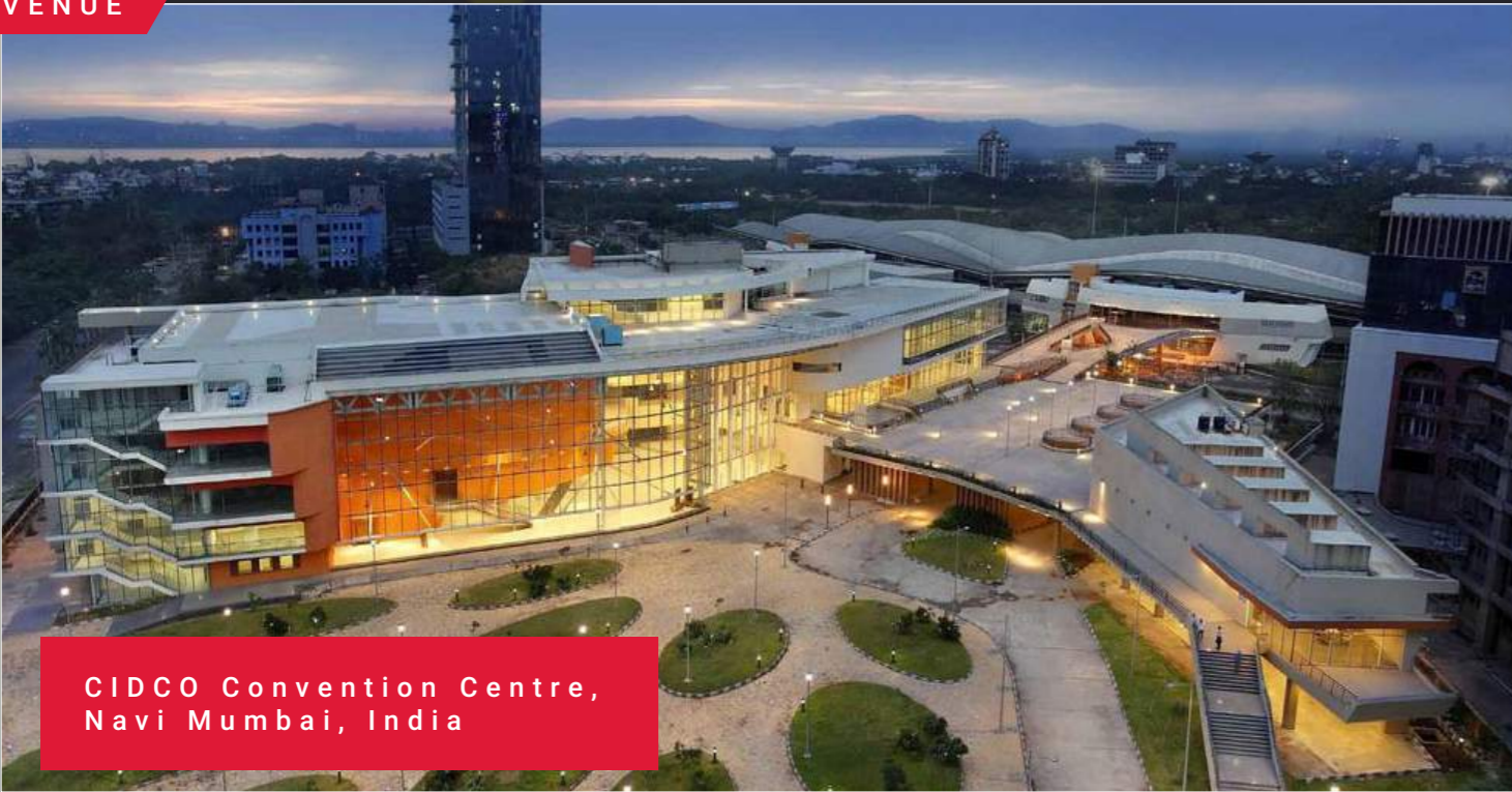
CIDCO Convention Centre, Navi Mumbai, India